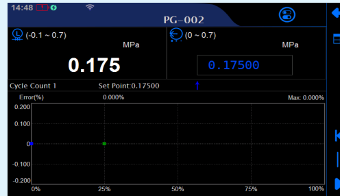
Pressure gauge / transmitter / switch calibration