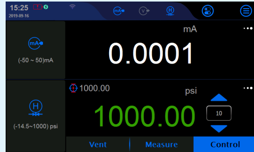
High Pressure Automated Calibration